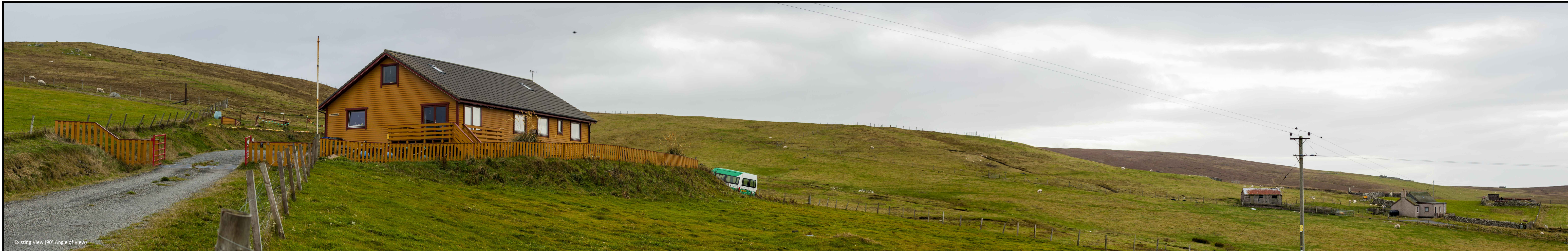
Existing View (90° Angle of View)