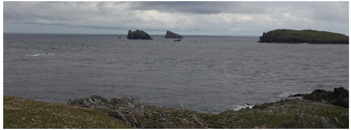
Point of Fethaland, grid reference 437912, 1195192