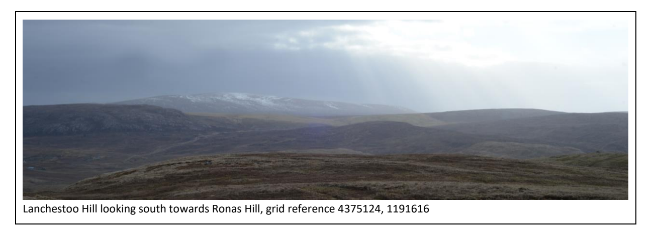
Table 5.1.6 – Hermaness Sub Unit – Typical Views