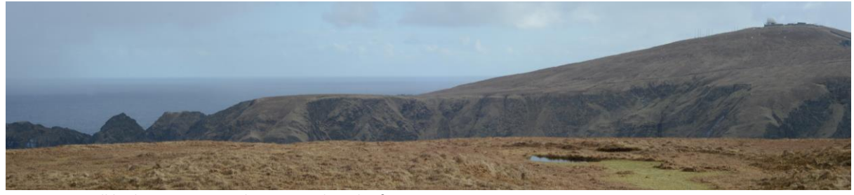
Hermaness Hill looking east towards Saxa Vord, grid reference 460690, 1217574