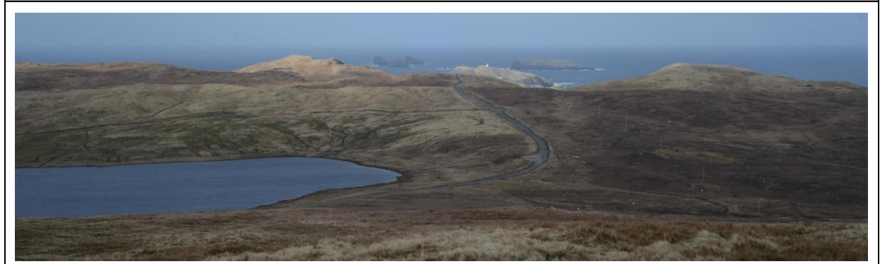
Lanchestoo Hill looking north to Upper Loch of Setter, grid reference 4375124, 1191616