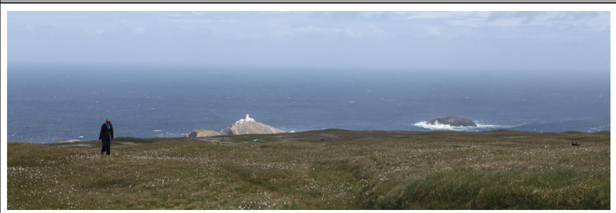
Hermaness Hill looking north towards Muckle Flugga, grid reference 460635, 1217655