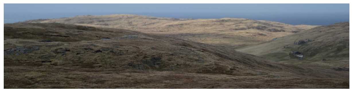
Lanchestoo Hill looking north west, grid reference 4375124, 1191616