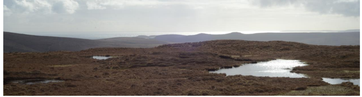
Hermaness Hill looking south towards Balta Sound, grid reference 460690, 1217574