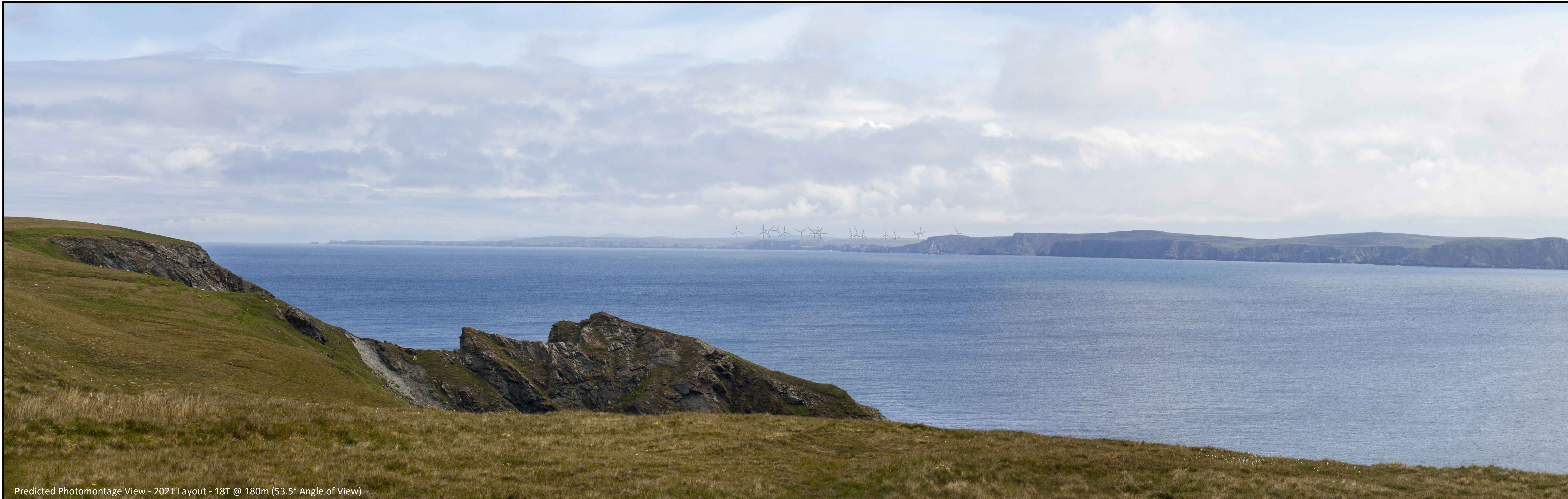
Predicted Photomontage View - 2021 Layout - 18T @ 180m (53.5° Angle of View)