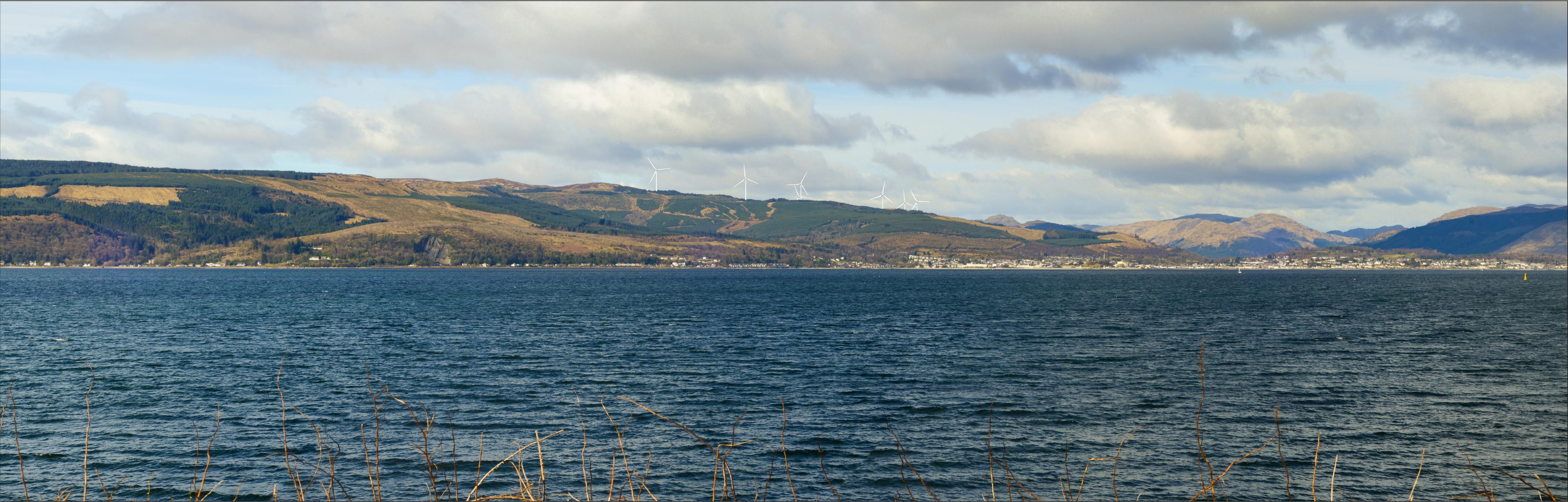
Viewpoint Location: E220091 N671887 Field of View: 53.5° (planar) Camera: Nikon D610 Viewpoint Elevation: 2.9m AOD Principal Distance: 812.5mm Lens: 50mm (Nikkor) View Direction: 320° Paper size: 841 x 297mm Camera Height: 1.5 AGL Nearest Proposed Turbine: 8.4km Printed image size: 820 x 260mm Date and Time: 12/03/2025 12:10 Viewpoint 16: Inverkip