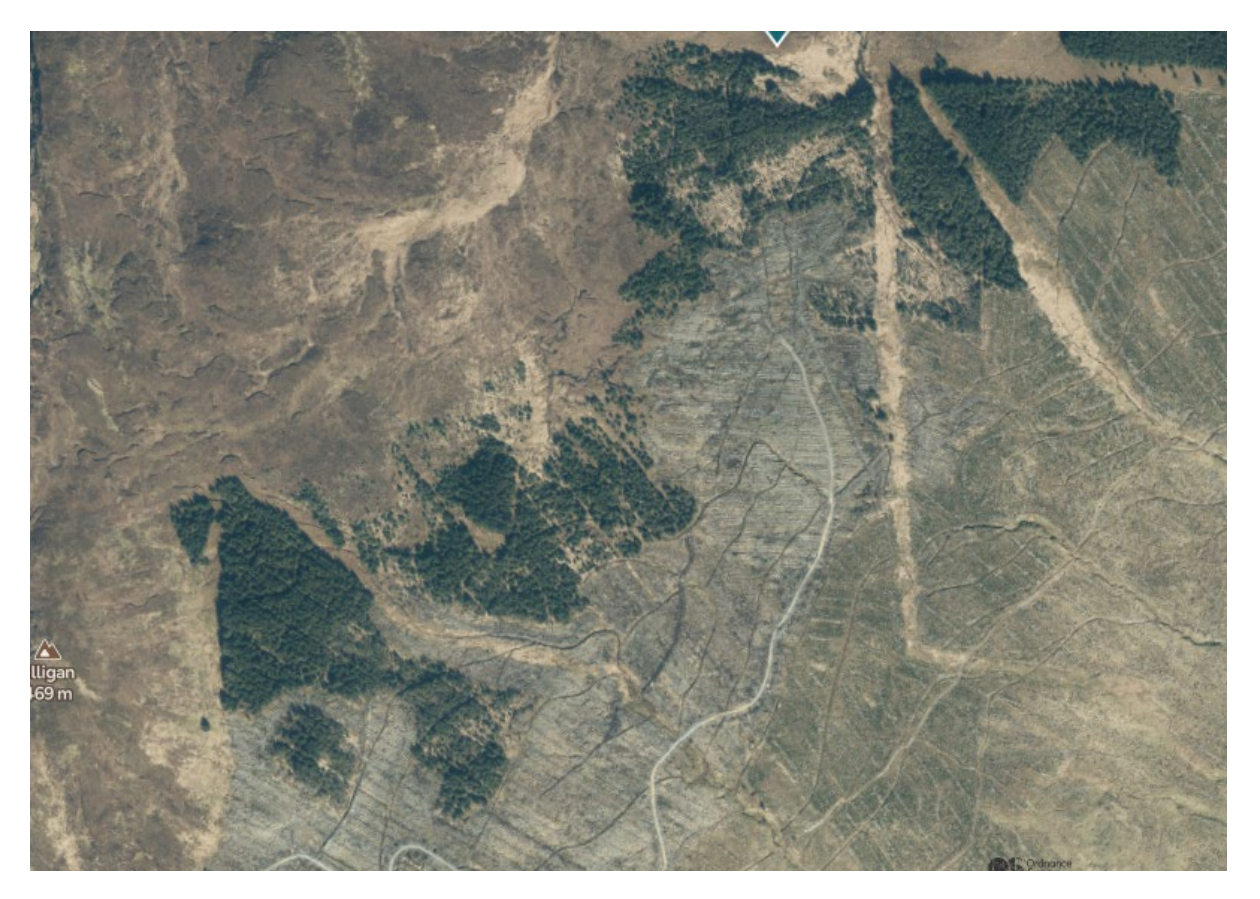
Plate 7 - Aerial imagery of poorly performing crop not felled with the adjacent coupe