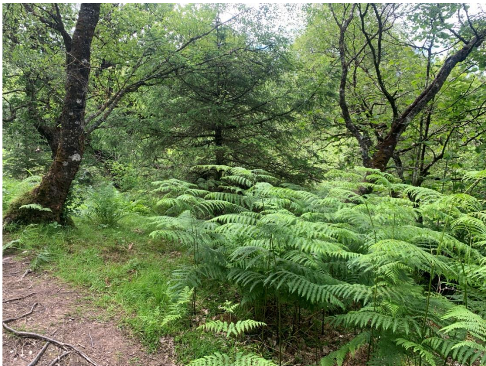
Plate 13: West-facing view from the Scheduled Dunloskin Wood, platforms and charcoal production area (Asset 3) showing Dunloskin wood