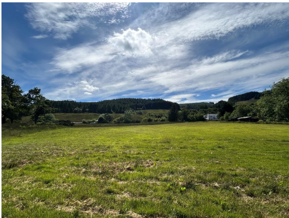
Plate 10: South-facing view from the Scheduled Adam's Cave, chambered cairn (Asset 1) towards the Scheduled Ardnadam multi-period settlement (Asset 2)