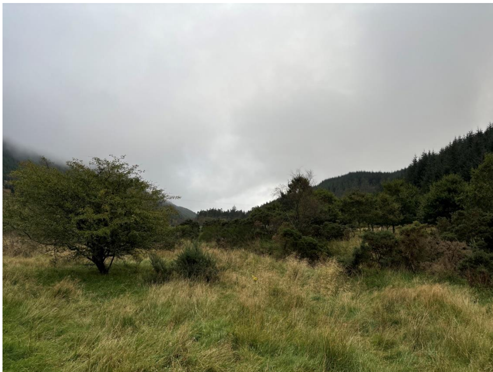
Plate 25: South-facing view from the southern edge of the Benmore Garden and Designed Landscape (Asset 22)