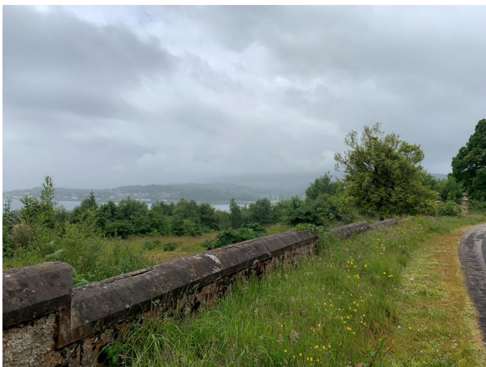
Plate 32: South-west-facing view towards the Site from the Category A Listed Dunselma (Asset 26)