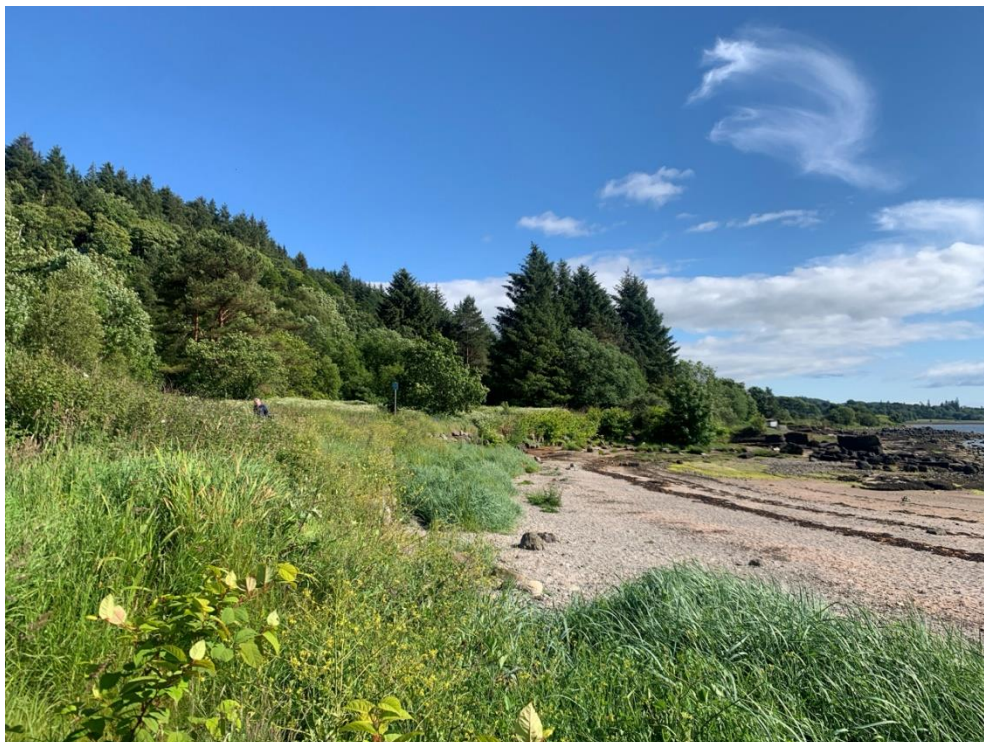
Plate 23: South-facing view towards Ardgowan Garden and Designed Landscape (Asset 20) showing intervening vegetation