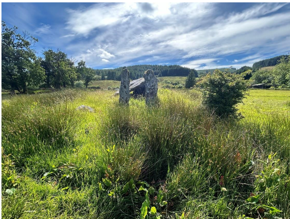
Plate 8: South-west-facing view showing the Site beyond the Scheduled Adam's Cave, chambered cairn (Asset 1)