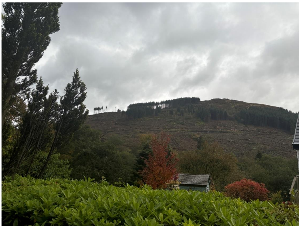
Plate 31: South-east-facing view towards the Site beyond Meall Buidhe from Clachaig Conservation Area (Asset 25)