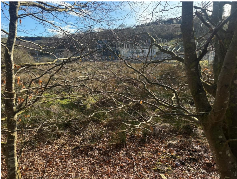
Plate 9: South-facing view from the Scheduled Adam's Cave, chambered cairn (Asset 1) showing Dunoon Grid Substation 210m to the south of the monument