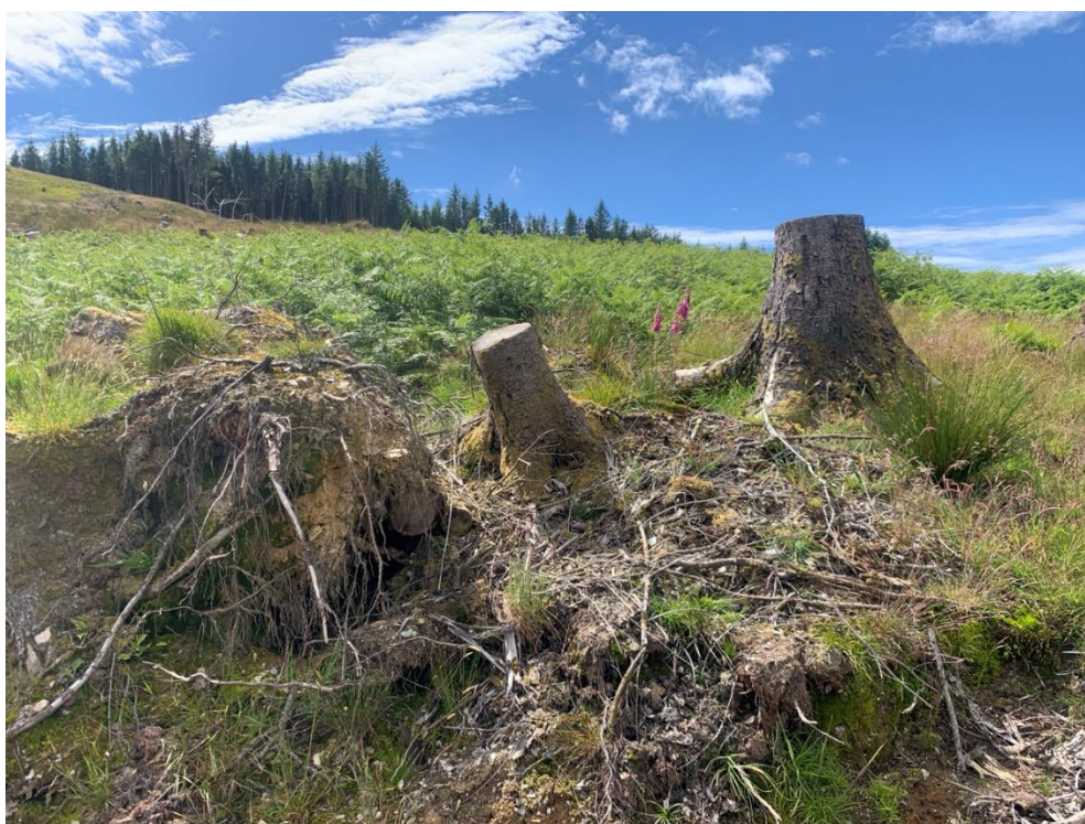
Plate 14: West-facing view from the southern end of the Scheduled Dunloskin Wood, platforms and charcoal production area (Asset 3) showing forestry