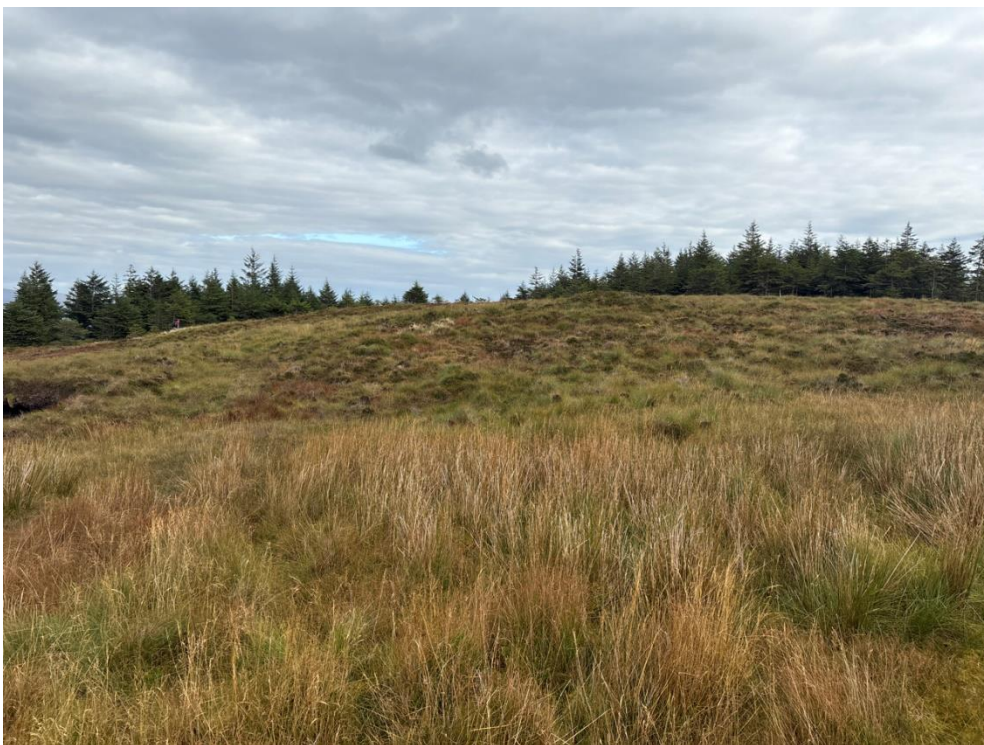
Plate 2: East-facing view of the Site showing ground conditions