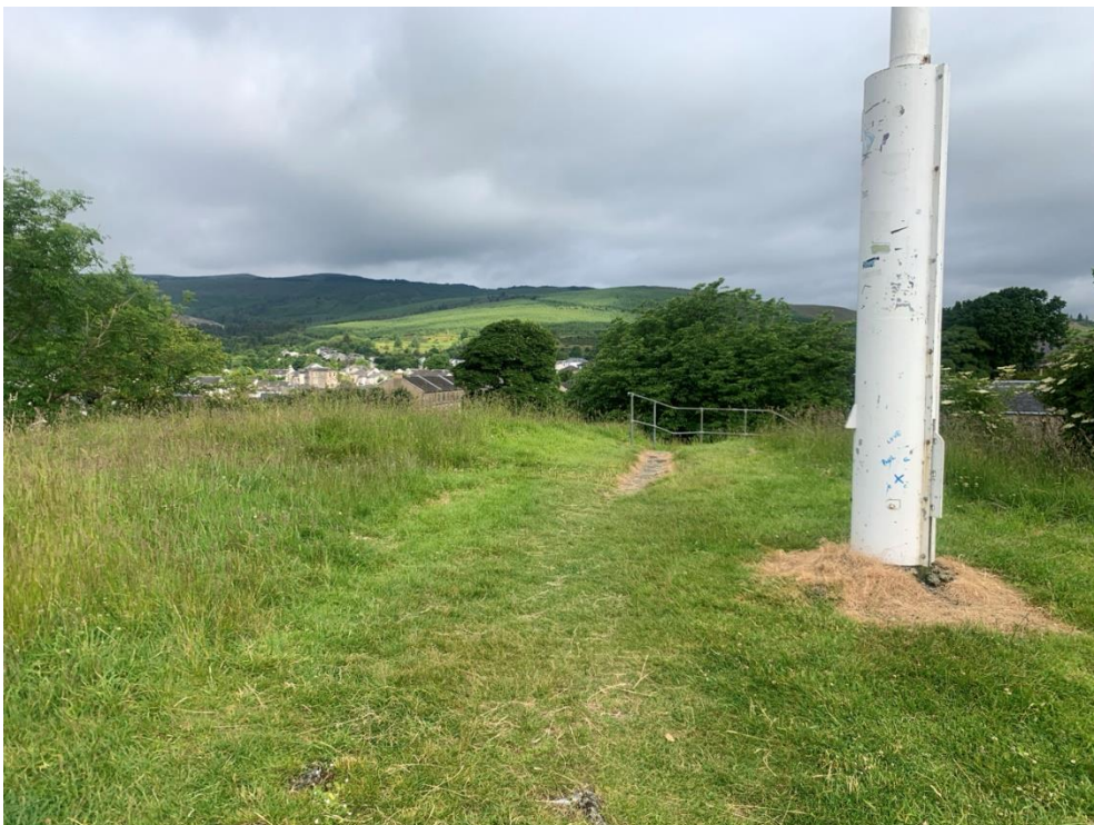
Plate 16: North-west-facing view showing the Scheduled Dunoon Castle (Asset 4) with the Site in background