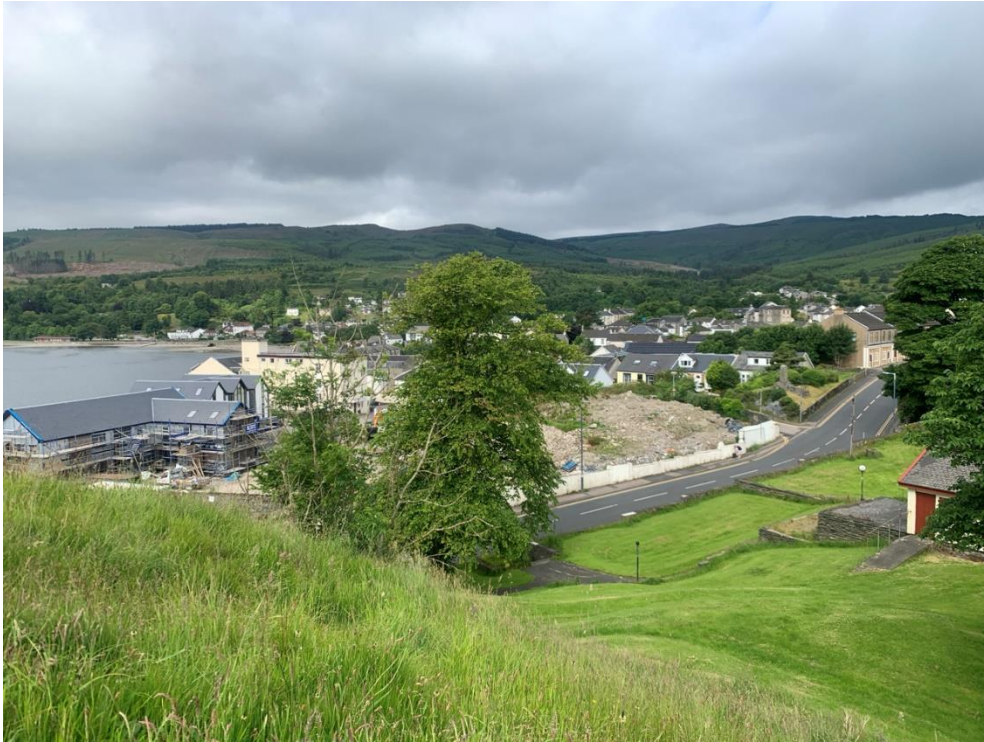
Plate 29: West-facing view from Dunoon Conservation Area (Asset 24) showing Cowal peninsula uplands