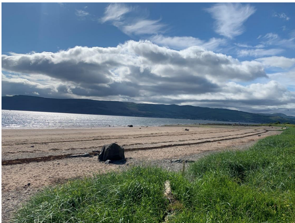
Plate 24: West-facing view from the northern end of the Ardgowan Garden and Designed Landscape (Asset 20) towards the Site