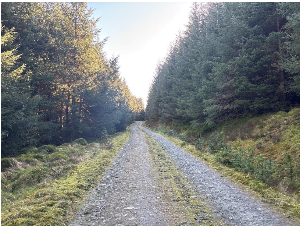
Plate 6: South-east-facing view showing existing access track with drainage cuts