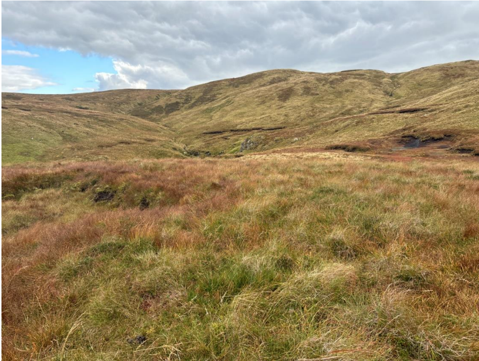
Plate 1: South-east-facing view of the Site showing ground conditions