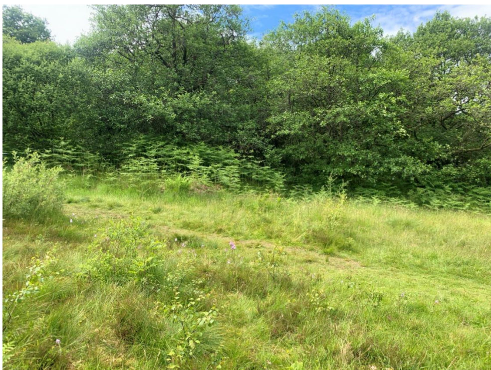
Plate 12: West-facing view from the Scheduled Ardnadam multi-period settlement (Asset 2) towards the Site