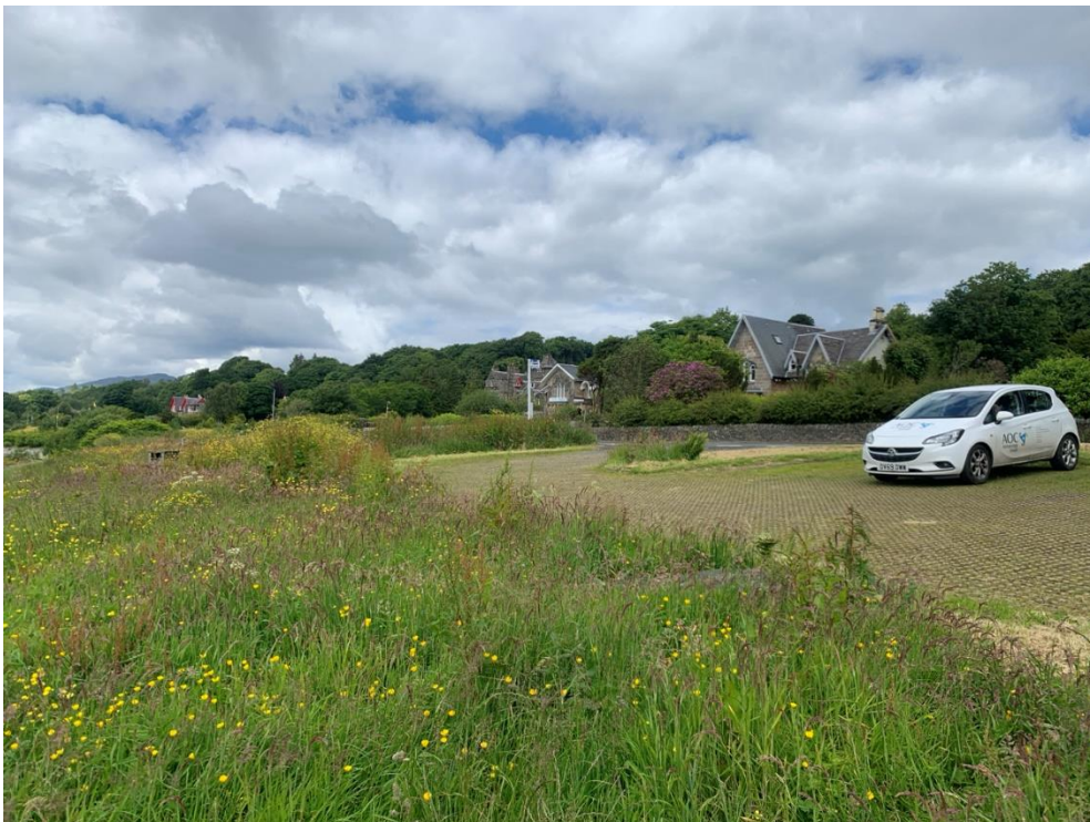
Plate 28: North-facing view towards Linn Botanic Gardens, Gardens and Designed Landscape (Asset 23)