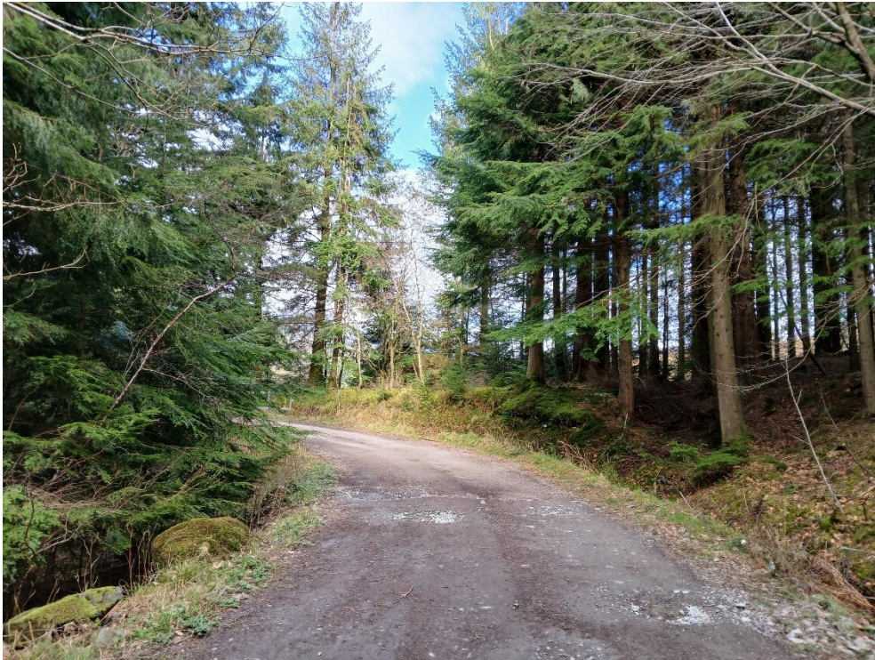
Plate 5: North-east-facing view showing northern end of access track