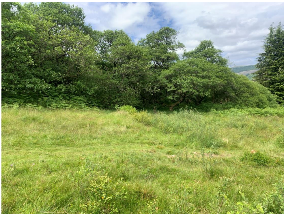
Plate 11: North-west facing view from the Scheduled Ardnadam multi-period settlement (Asset 2) showing Dunloskin Woods