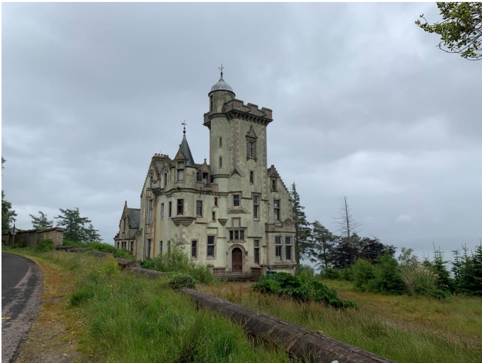
Plate 33: South-east-facing view towards the Category A Listed Dunselma (Asset 26)