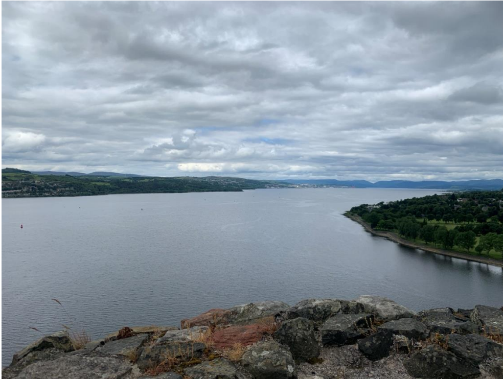
Plate 37: West-facing towards the Site from the Scheduled Dumbarton Castle (Asset 100)