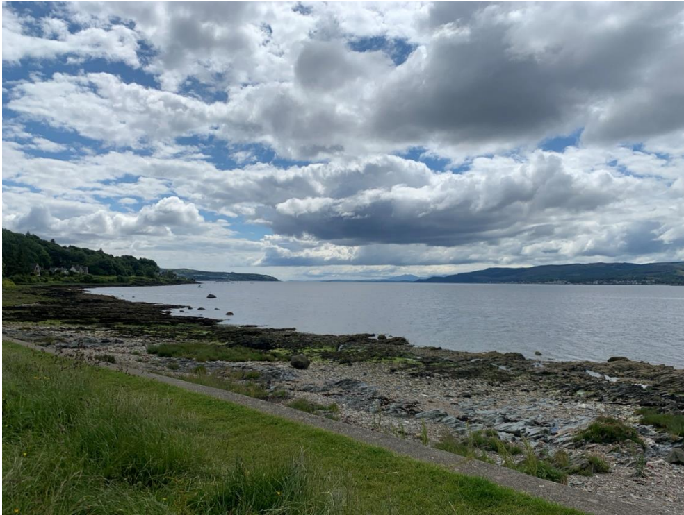
Plate 27: South-west-facing from Linn Botanic Gardens, Gardens and Designed Landscape (Asset 23) overlooking Loch Long