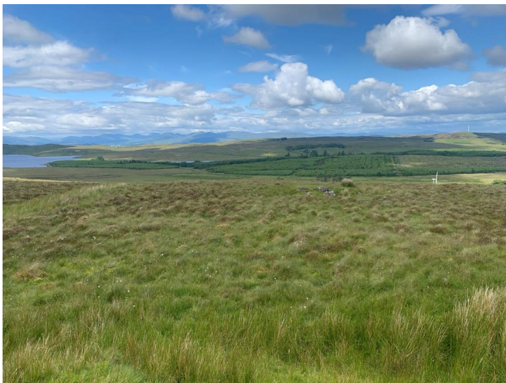
Plate 36: North-west-facing view towards the Site from the Scheduled Dowries, cairn (Asset 99)