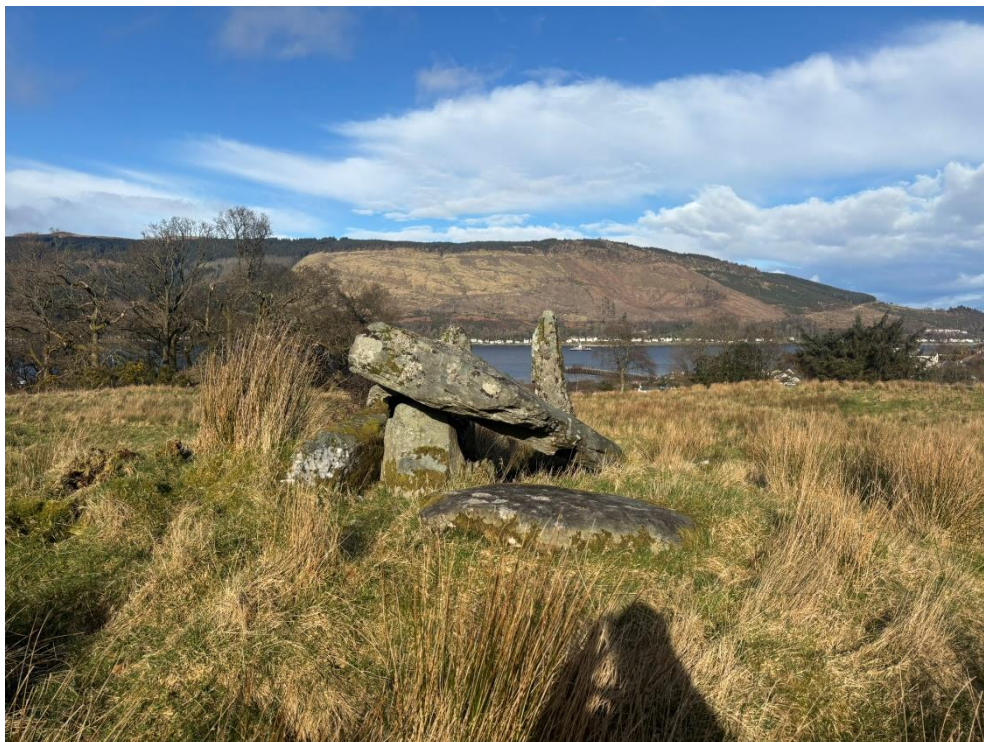
Plate 7: North-east-facing view showing the Scheduled Adam's Cave, chambered cairn (Asset 1) in the foreground