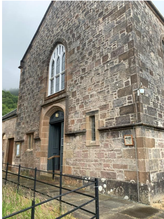
Plate 19: East-facing view showing the Scheduled Kilmun Collegiate Church (Asset 5)