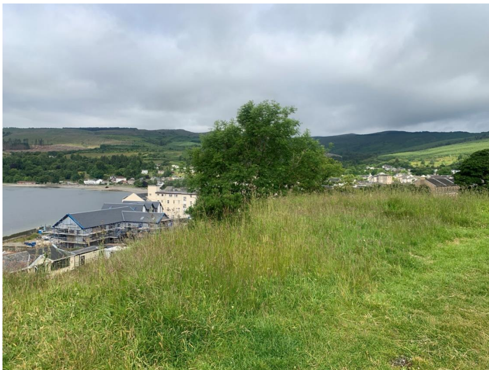
Plate 18: West-facing view from the Scheduled Dunoon Castle (Asset 4) showing the Cowal peninsula upland hill