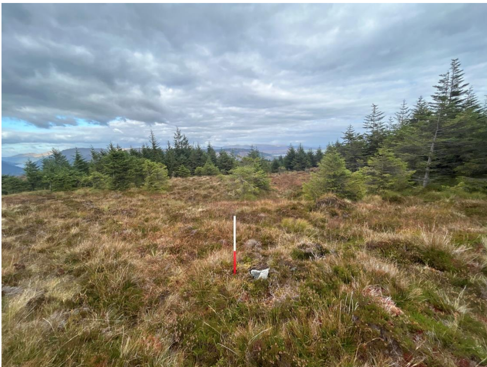
Plate 4: Possible remains of clearance cairns (Asset 105)