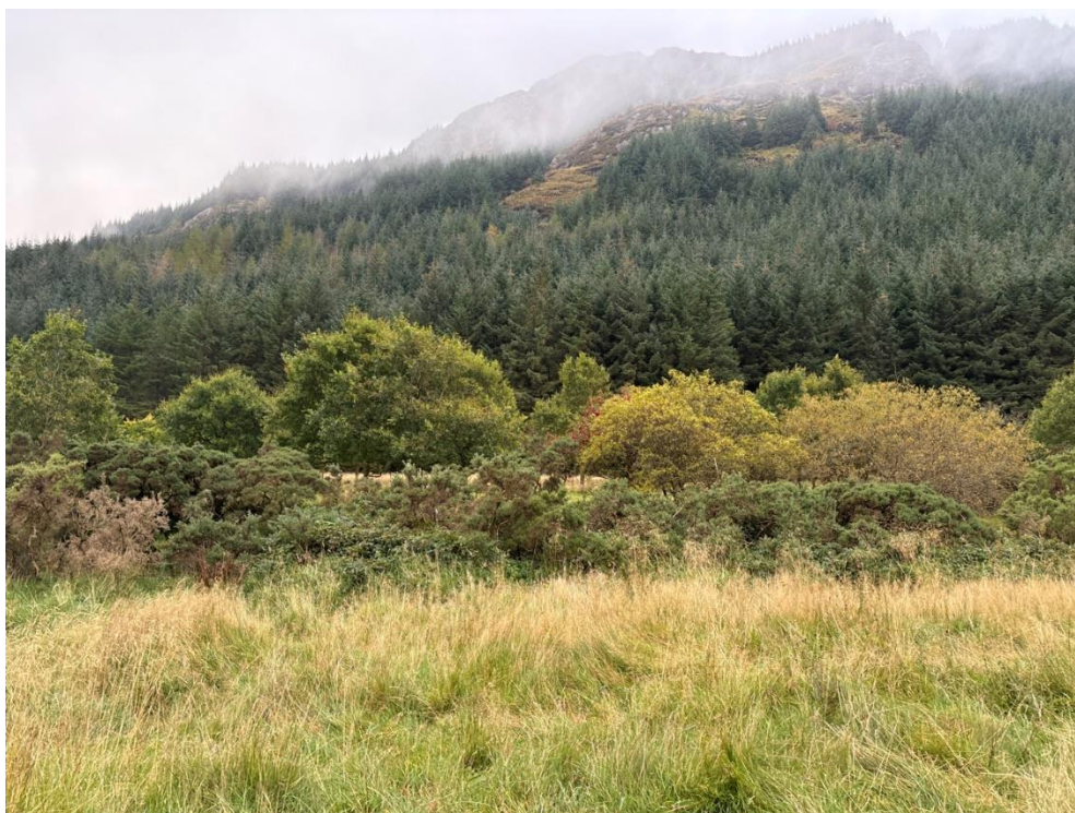
Plate 26: South-facing view from the southern edge of the Benmore Garden and Designed Landscape (Asset 22) showing Meall an Fhamhair