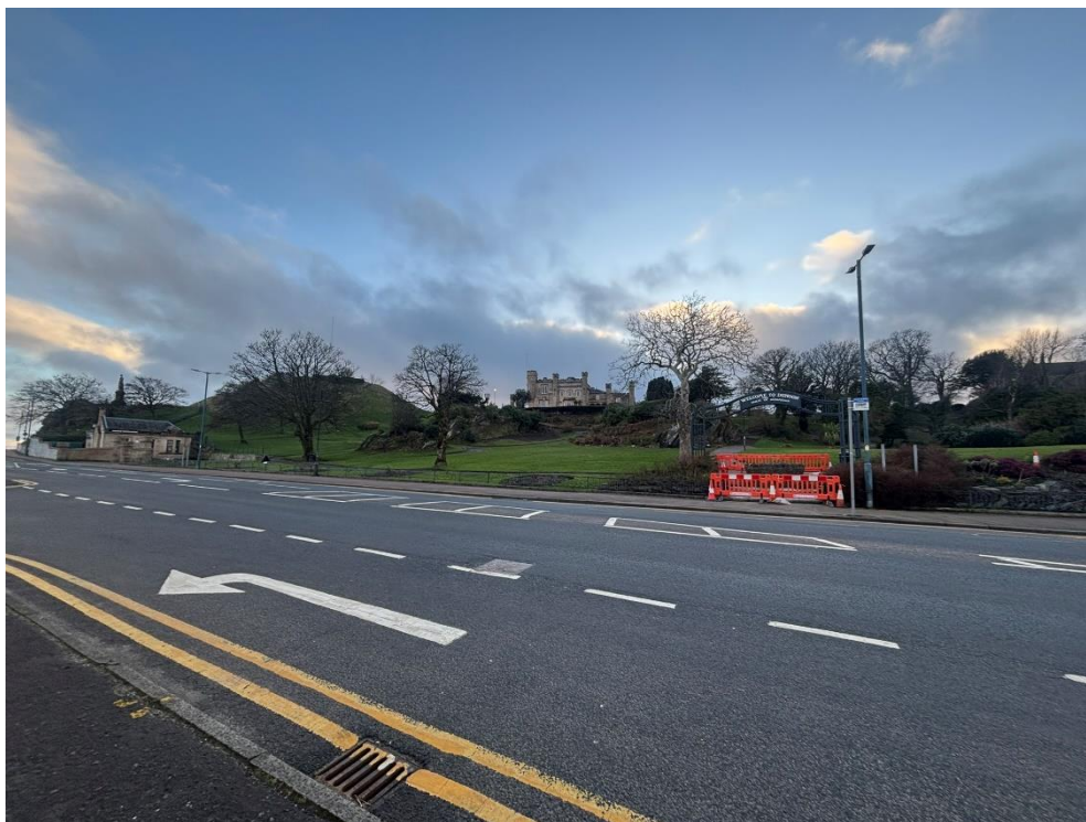
Plate 17: South-west-facing view towards the Category B Listed Castle House, Kirk Street, Dunoon (Assets 42) and the Scheduled Dunoon Castle (Asset 4) from the pier