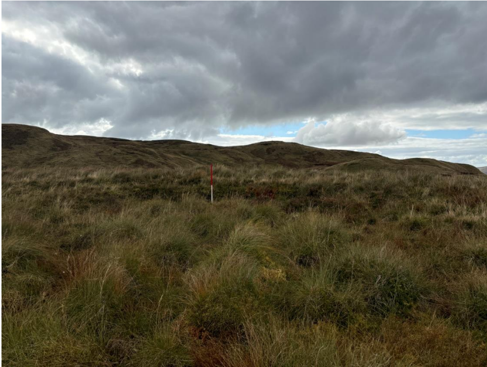
Plate 3: Sub-circular depression surrounded by a bank (Asset 106)