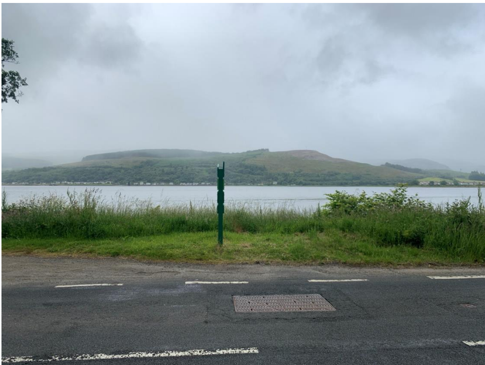
Plate 34: South-west-facing view towards the Site from the Category A Listed Old Kilmun House (Asset 28)