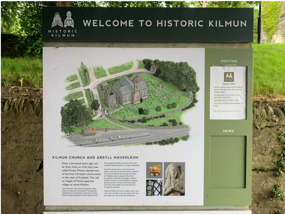
Plate 22: Scheduled Kilmun Collegiate Church (Asset 5) and Category A Listed Parish Church of Kilmun (Asset 31) information board