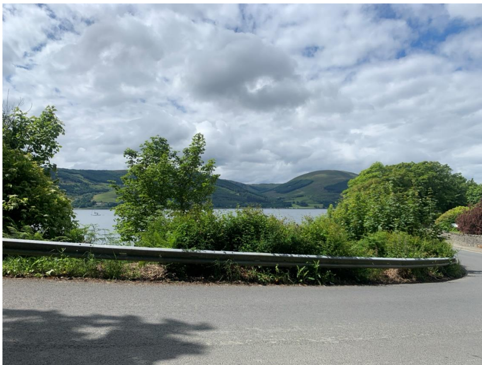
Plate 35: South-west-facing view towards the Site from the Category A Listed Knockderry Castle With Boundary Walls, Gatepiers And Railings (Asset 95)