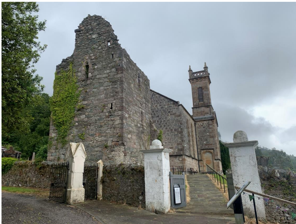
Plate 20: North-east-facing view of the Category A Listed Parish Church of Kilmun (Asset 31) with the Scheduled Kilmun Collegiate Church (Asset 5)