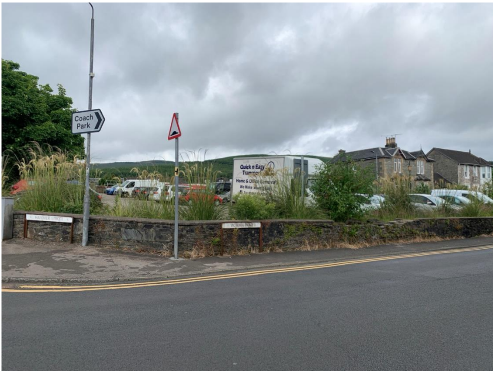
Plate 30: North-west-facing view towards the Site from Dunoon Conservation Area (Asset 24)