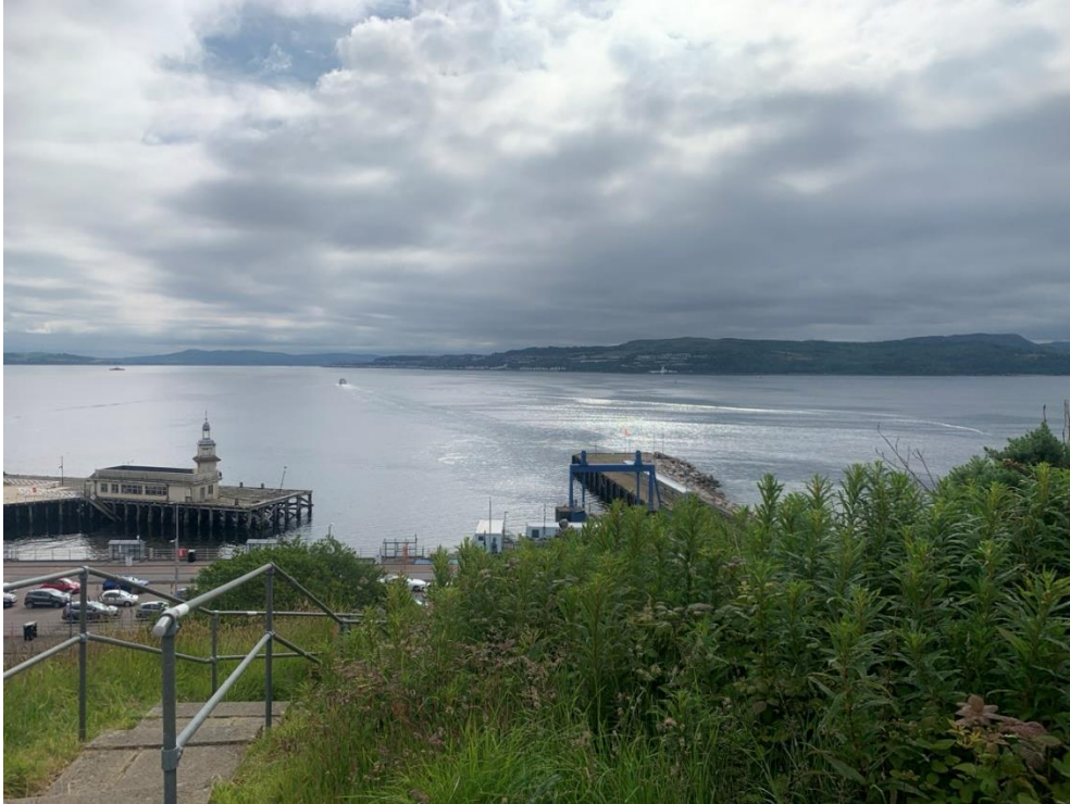
Plate 15: East-facing view over the Firth of Clyde from the Scheduled Dunoon Castle (Asset 4)