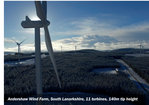
Andershaw Wind Farm, South Lanarkshire, 11 turbines, 140m tip height

We invite you to review our updated proposals.