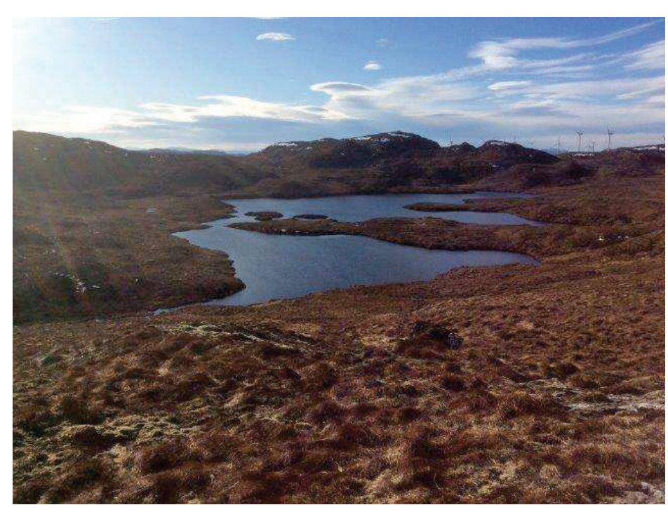
Plate 11: Typical view of western section of Site supporting open moorland with lochs.