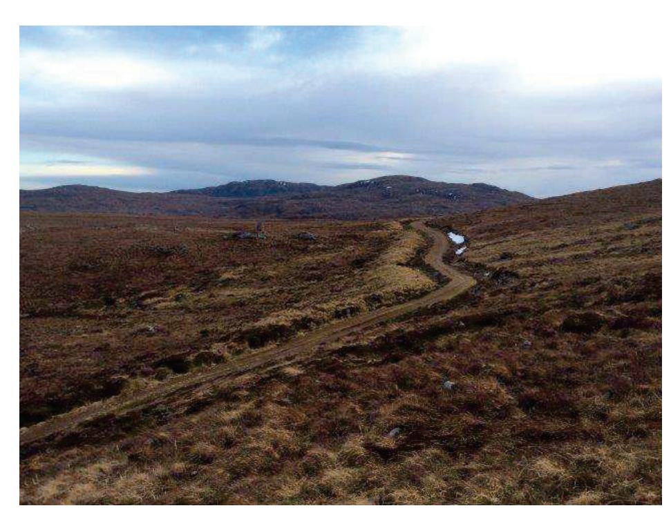
Plate 12: View along track in from north to bothy.