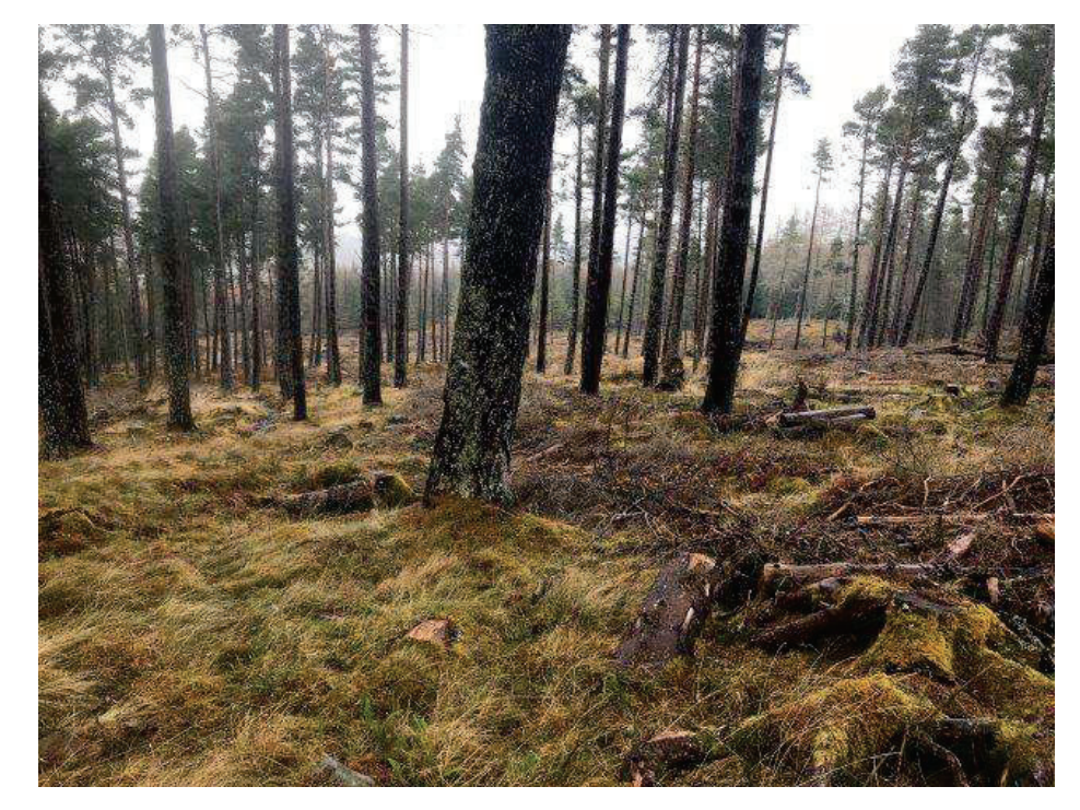
Plate 1: View of thinned woodland on northern slopes outwith Site (TN24).