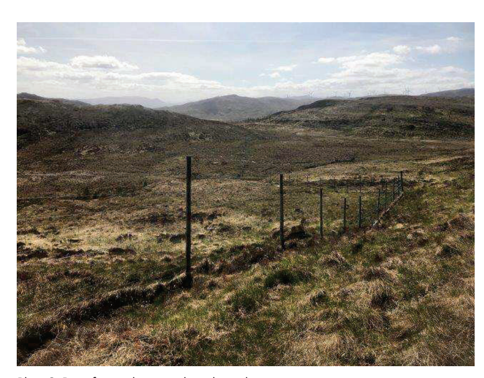
Plate 8: Deer fence along southern boundary.