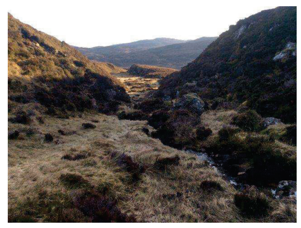
Plate 9: Vegetated valley sides with small cavities, suitable for use as a den. No signs of use identified (TN41).