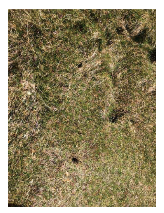
Plate 5: One of the many locations supporting active water vole colonies that may be a prey source.