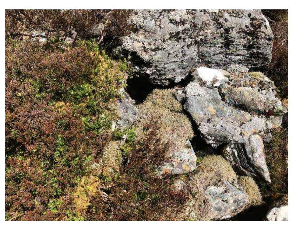
Plate 4: Further typical feature within boulder scree offering potential for use as a den.