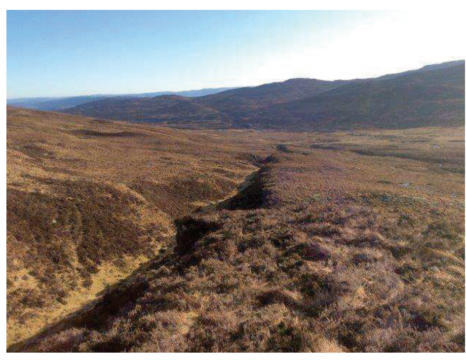
Plate 10: Typical view of central area showing landscape features that may act as movement corridors (TN30).