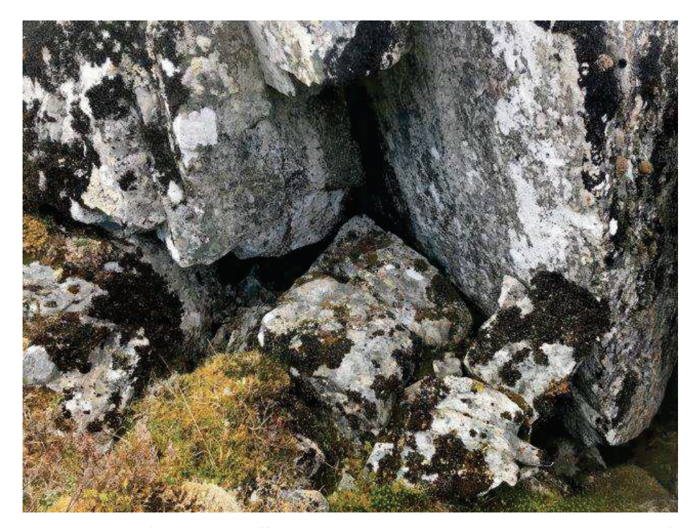
Plate 3: Typical feature that offers suitability for use as a den but shows no sign of use.