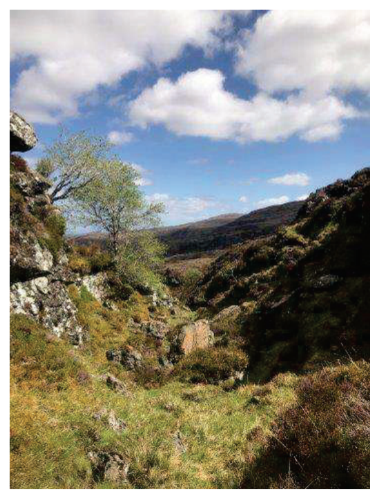
Plate 7: Narrow valley with suitable features for denning and could serve as a sheltered movement corridor (TN 21).