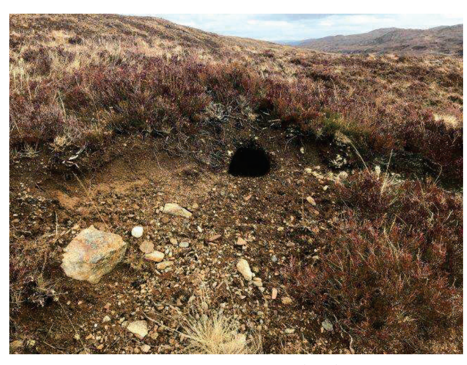
Plate 6: Single animal burrow consistent with badger (TN39).