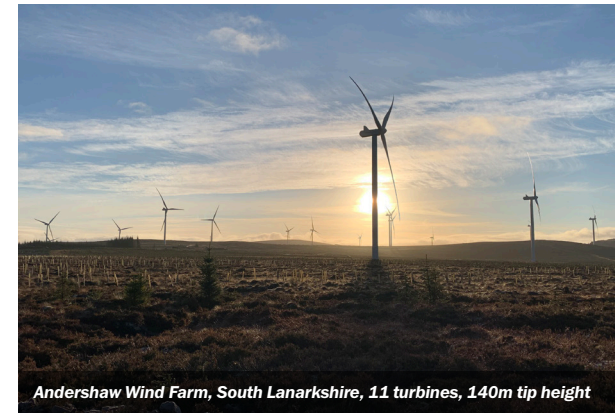
Andershaw Wind Farm, South Lanarkshire, 11 turbines, 140m tip height

We invite you to review our updated proposals.