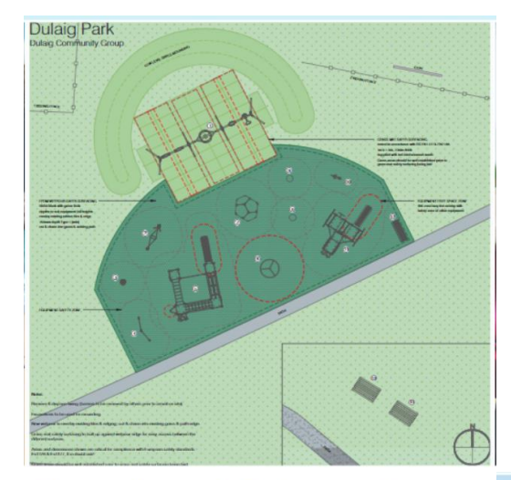
New and upgraded playgrounds