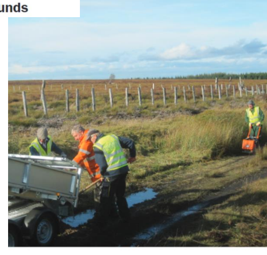
Maintaining and Upgrading Recreational Paths