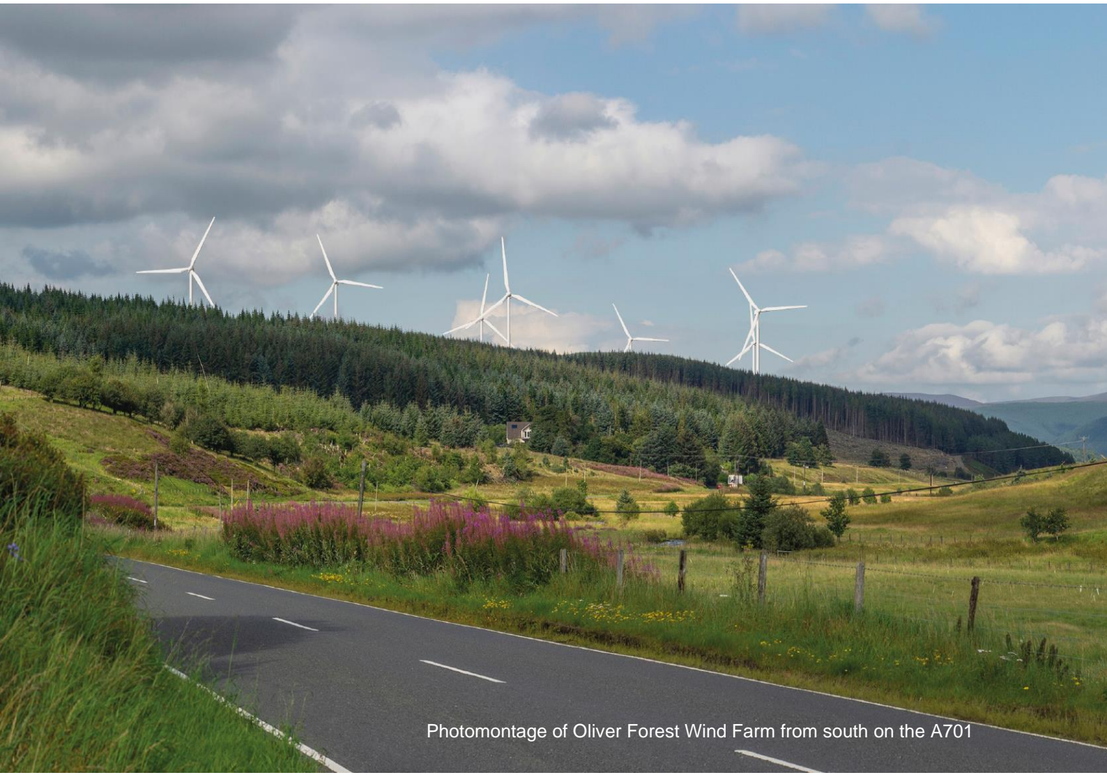
Photomontage of Oliver Forest Wind Farm from south on the A701