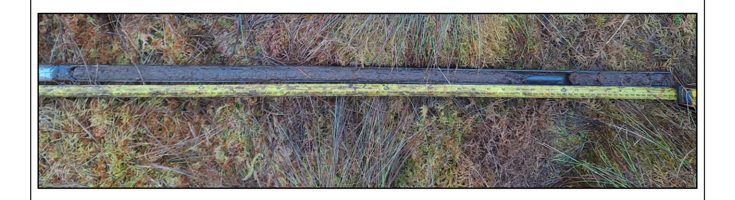
Peat Auger 3 1.0 – 2.0m