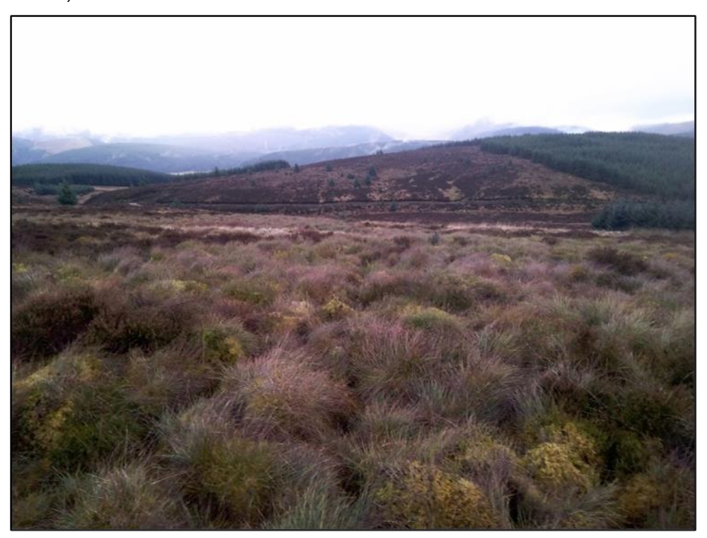
Photo A: View facing south-east across moorland surrounding Turbine 4, taken from NGR 307399, 624264

The aerial photographs were used to identify the major geomorphological features such as the breaks of slope and landslips. Geomorphological features of interest were identified during site visits when more detailed assessment was undertaken. Typical conditions observed throughout the Proposed Development site are shown below in Photos 1, 2, and 3.