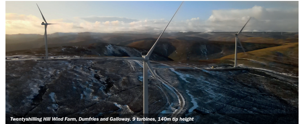
Twentyshilling Hill Wind Farm, Dumfries and Galloway. 9 turbines, 140m tip height

We are writing to you to introduce ourselves and our proposal for Coille Beith Wind Farm.